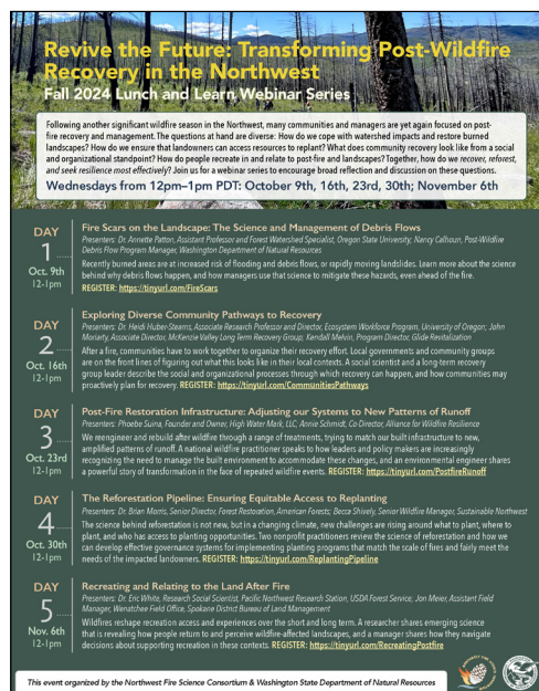
Flyer for the 'Revive the Future' webinar series.