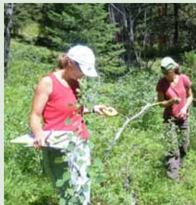
Members from the Lemhi County Forest Restoration Group conduct aspen tree monitoring.

“The U.S. Forest Service and the LFRG will work together to develop, discuss, evaluate, and implement innovative landscape-scale planning, project preparation, treatment, science integration, monitoring, and adaptive management strategies.”