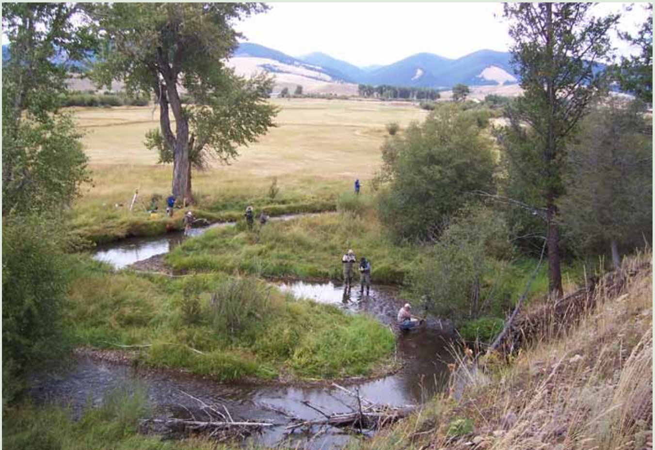
The Blackfoot Drought Committee was established in 2000 to address declining fisheries and water allocation in the Blackfoot river basin in western Montana.

Drought Committee members point to two factors that make the plan effective: users were invited to help craft the management plan, and the state has always been willing to work with users to seek alternatives to shutting down operations. The state retains its authority to enforce water rights and close areas to fishing, but generally relies on the concept of shared sacrifice rather than formal enforcement to maintain compliance.