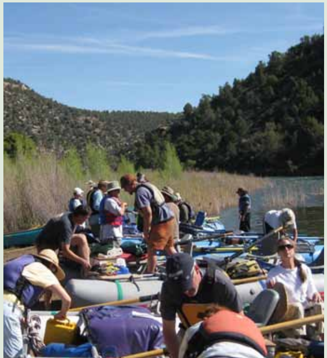
The Lower Dolores Working Group used joint fact-finding to address disagreement over the condition of native fisheries and minimum flow needs for whitewater boating.

The group agreed at the outset that they would accept the experts’ collective synthesis of the science, but that the scientists’ management options would be further evaluated for social, economic, and legal feasibility. A subcommittee, including agency decision makers and county elected officials, environmental group representatives, and water users, discussed and refined the management options in terms of legal and fiscal feasibility and water users’ needs. The group then separated the options into those that could be implemented immediately and those that would require fundraising or policy changes.