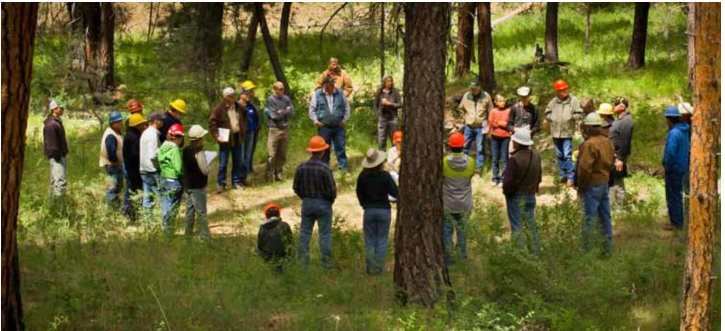
Some collaborative resource management groups are using structured procedures to collectively evaluate their work and adapt their plans and management actions.

Appendix II and III provide more details from the rapid assessments. Appendix II includes case summaries of evaluation and adaptation in three collaborative groups, the Bankhead Liaison Panel, Blackfoot Drought Committee, and Dinkey Collaborative. Appendix III provides worksheets and examples of several of the tools discussed in the sourcebook.