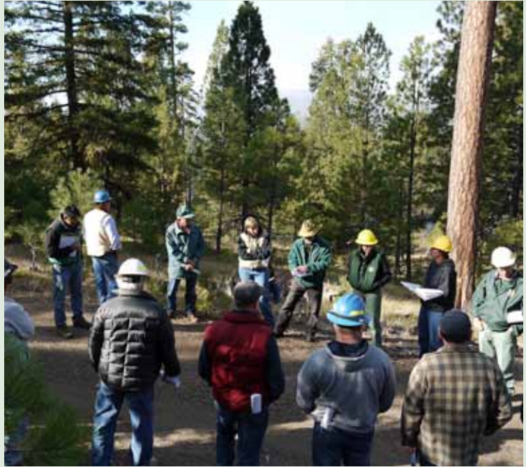
Members of the Central Oregon Partnership for Wildlife Risk Reduction gather during a field trip. The group often conducts multiparty field reviews to discuss how well the project met desired outcomes and share lessons learned to carry forward into future projects.

The Central Oregon Partnership for Wildfire Risk Reduction (COPWRR) uses a type of after-action review to evaluate implementation and outcomes of forest restoration and fuels reduction projects. Participants represent contracting foresters, environmental groups, and resource management agencies, including project interdisciplinary team members. The group evaluates projects using forms that describe the project's original purpose and need, management objectives, silvicultural prescriptions, and best management practices. Participants visit three to five treatment units and discuss how well the project met desired outcomes, what factors arose during implementation that affected the process or outcomes, what adaptations were made along the way, and lessons learned that the group would like to see carried forward into future projects. Through back-and-forth discussion and debate, the group develops a shared project evaluation and recommendations for future management, which then become part of the group's permanent record.