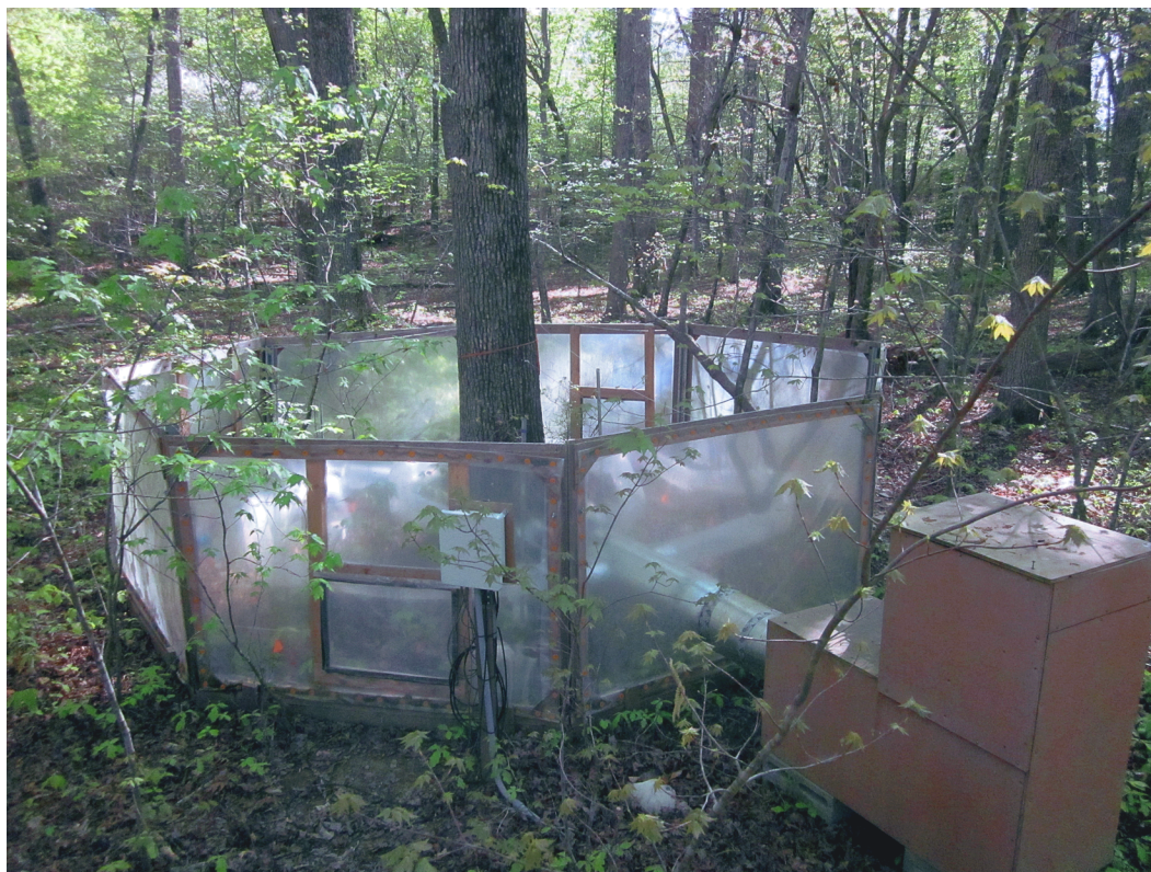
PLATE 1. A single chamber within the experimental climate warming array at Duke Forest, Hillsborough, North Carolina, USA ( \sim 36^\circ ).

each of the ant species present in the pitfall traps at Duke and Harvard Forests were obtained from the primary literature and museum records (Fitzpatrick et al. 2011).