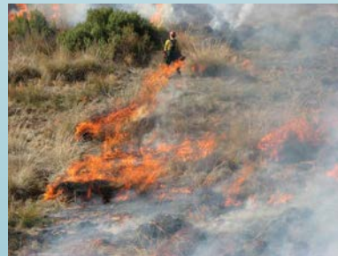
A prescribed burn in McCabe Canyon at Pinnacles National Park in 2011.

The burn was small—only 2 acres—but it portends big things, not only for the Amah Mutsun people but for the whole ecological and human community. McCabe Canyon's oaks, grasslands, and riparian bottomlands represent a once widespread but now threatened California ecosystem. Before the 2009 prescribed burn, the unmanaged canyon was overrun with wild pigs and full of exotic weeds. "Native Americans used to burn frequently in there," says Johnson. "And then one day it stopped. We're working with fire now to restore species diversity, but we're also helping to restore the other things that have been lost—the cultural processes of the people."