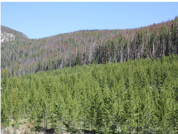
A young, healthy stand of lodgepole pine grows in the foreground with a backdrop of trees affected by a mountain pine beetle outbreak.

Insects, pathogens, and parasitic plants, including both native and nonnative biota, that affect tree decline, mortality, and forest ecosystem processes. BDAs interact with abiotic factors such as fire and drought to determine forest composition and structure at stand and landscape scales. BDAs are a natural part of forest ecosystems and are essential to many forest functions; healthy forests are able to resist or recover from biological disturbance.