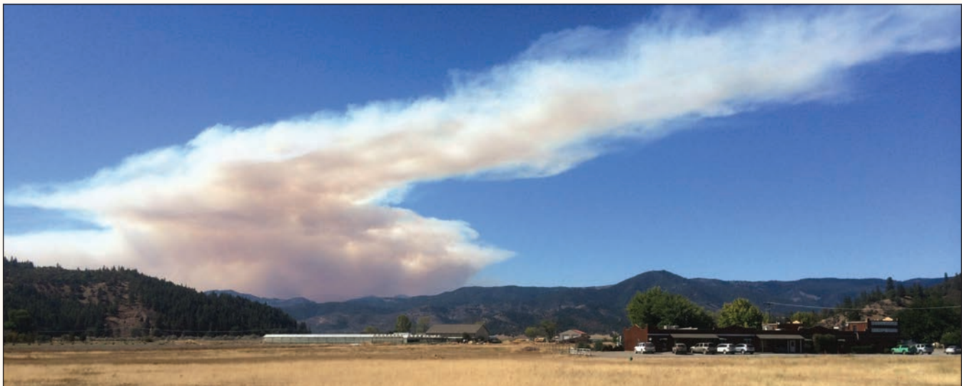
Smoke can travel hundreds of miles, affecting communities far away. Scientists have developed a modeling framework called BlueSky that predicts where the smoke will go.