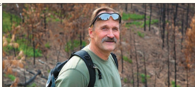
Landscape ecologist Paul Hessburg studies forest health and wildfire dynamics. “We need to learn to coexist with wildfire,” he says.

are in need of some sort of landscape restoration to change fuel patterns, forest age and forest-density conditions.