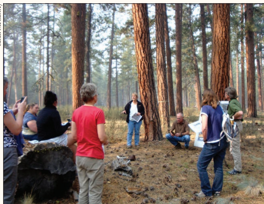
Communication is key. Researchers and Sisters Ranger District staff take a field trip near Sisters, Oregon amid smoke from a nearby wildfire.