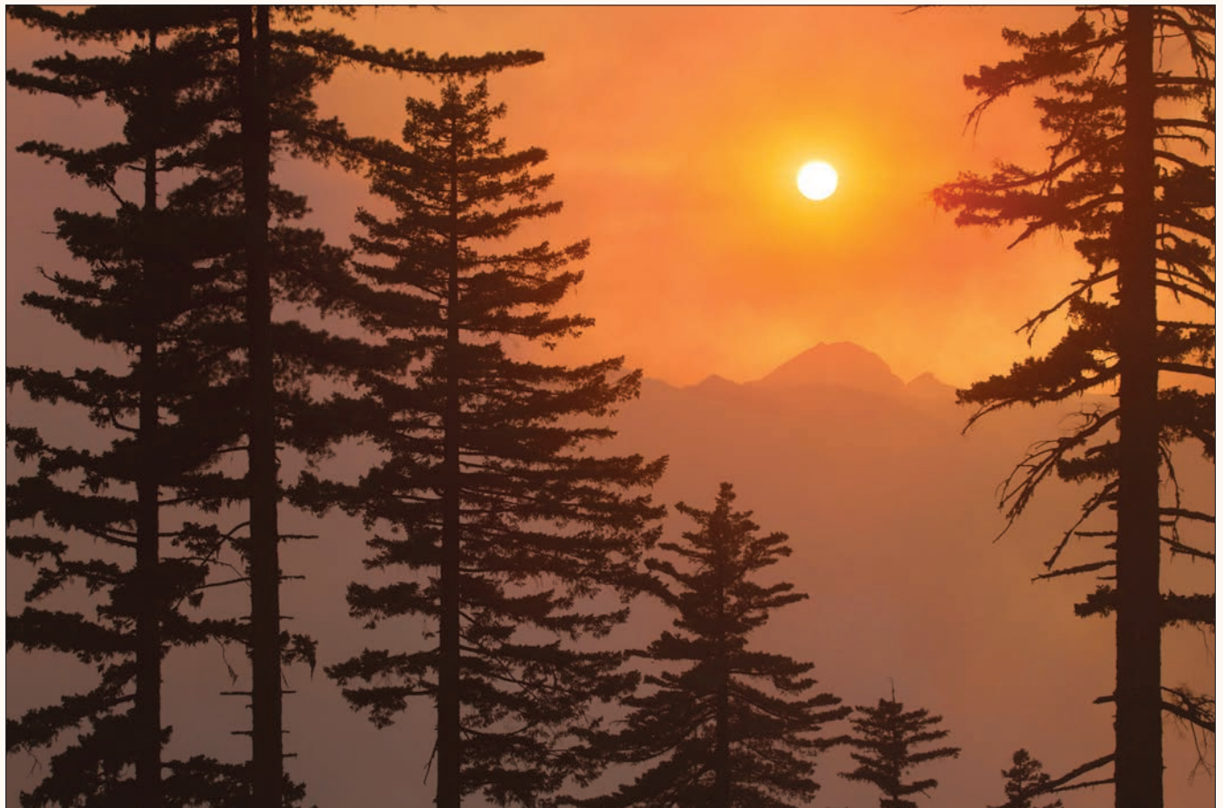
The sun sets through smoke-filled skies at the Happy Camp Complex Fire in the Klamath National Forest in California.