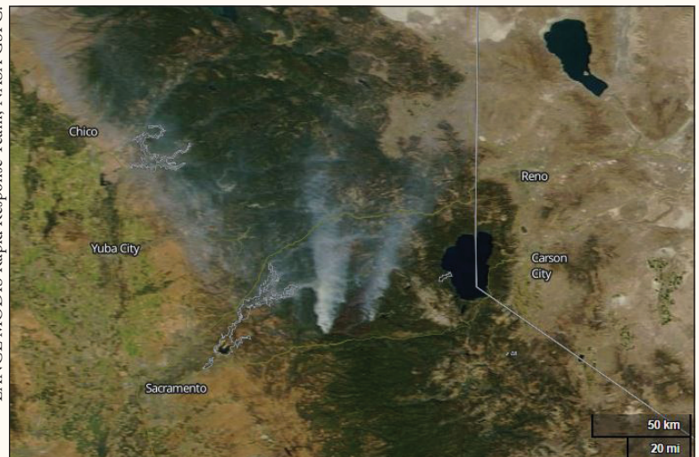
The King Fire burning near Lake Tahoe on September 14, 2015.

PNW SCIENCE UPDATE synthesizes current research that addresses pressing questions about management of our natural resources and the environment. It is published by: