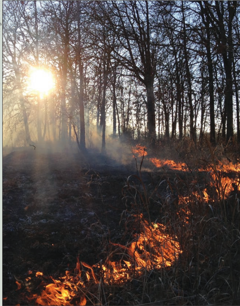
Prescribed fire (above) behaves differently than wildfire. Morgan Varner is working on computer models that incorporate the unique burning patterns of prescribed fire.