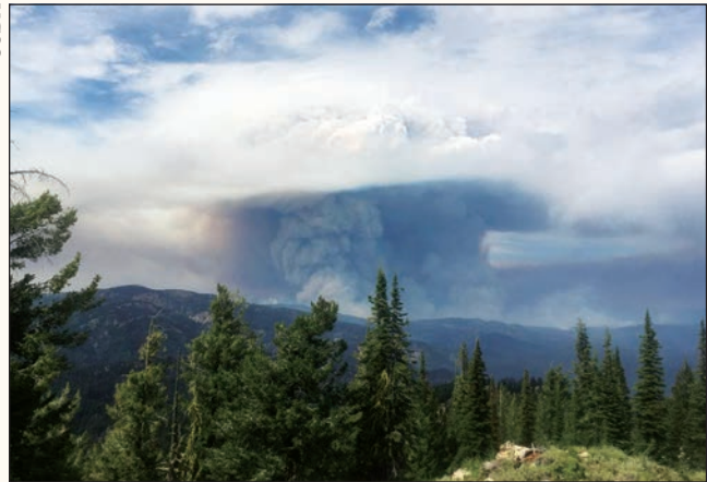
The size of wildfires in the West has been growing, leading to smoky summers for many communities..