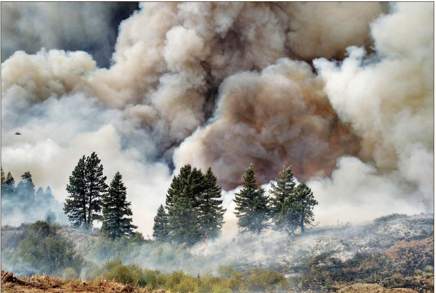
Pioneer Fire, Idaho. This was the largest fire on Forest Service land in 2016.

Within half an hour of the starting gun going off, her plans, hopes, and expectations for the day changed radically. Race directors announced the cancellation of the triathlon due to smoke from the King Fire, which had started the week before and eventually burned across 97,000 acres in northern California. “We were all in our wetsuits standing there at the lake, ready to start. It was such a shock. Especially because where we were, there was hardly any smoke.