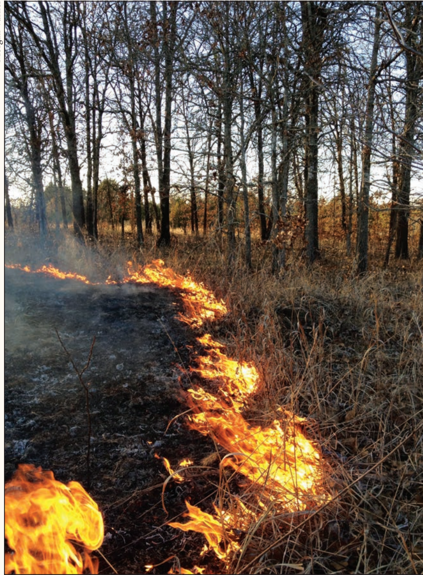
Prescribed fire like this can be planned to reduce smoke impacts.