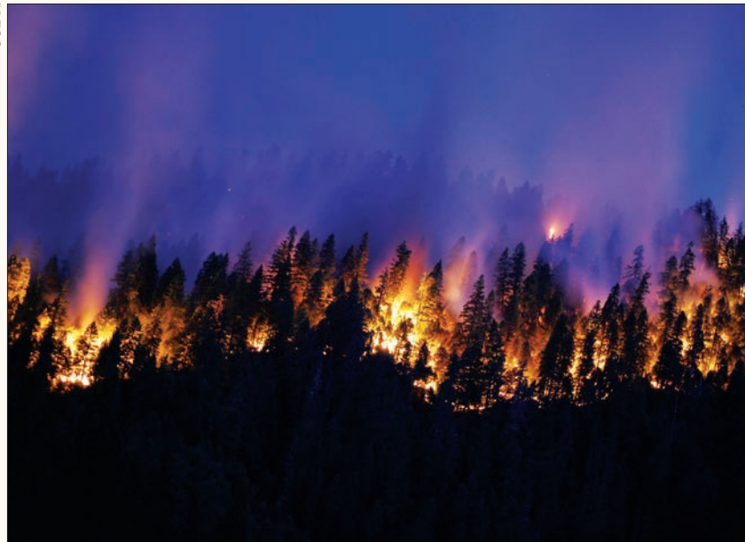
The Happy Camp Complex Fire in the Klamath National Forest in California.